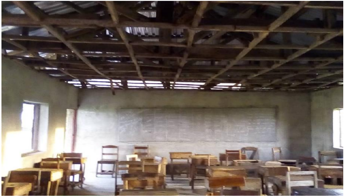
Uncompleted MDG project of 3-classroom block