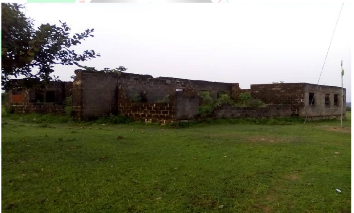
Uncompleted administrative block