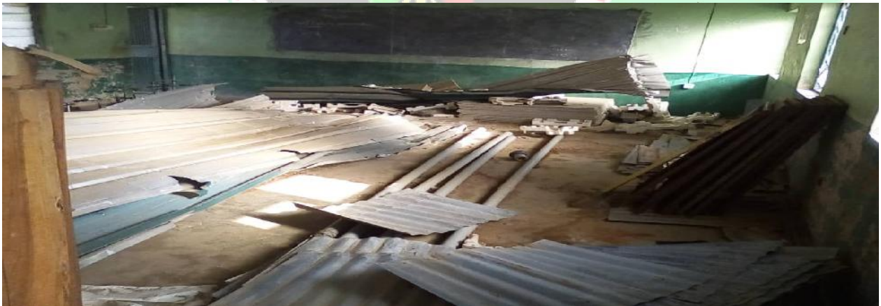
Classroom converted to a multipurpose store