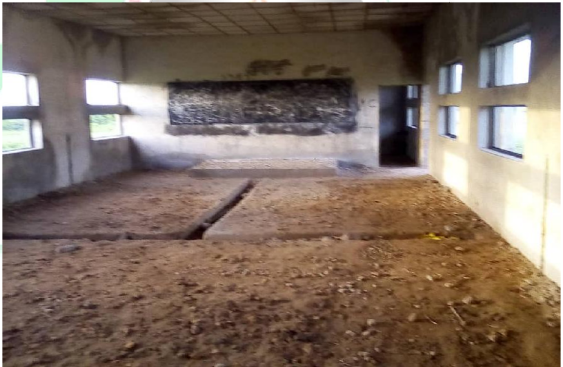
Uncompleted Physics lab converted to classroom