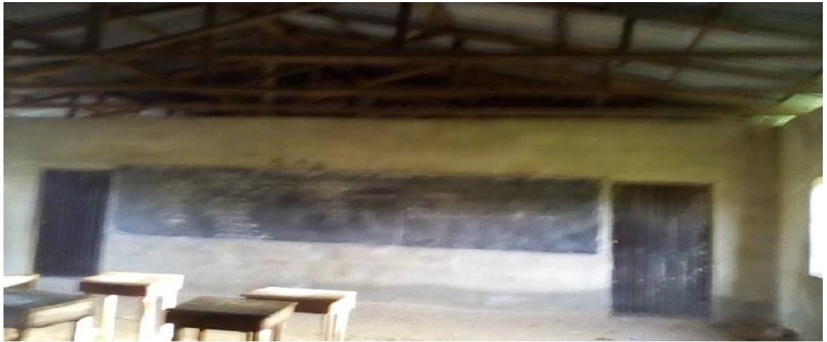
Ceilingless and floorless classroom used as exam hall