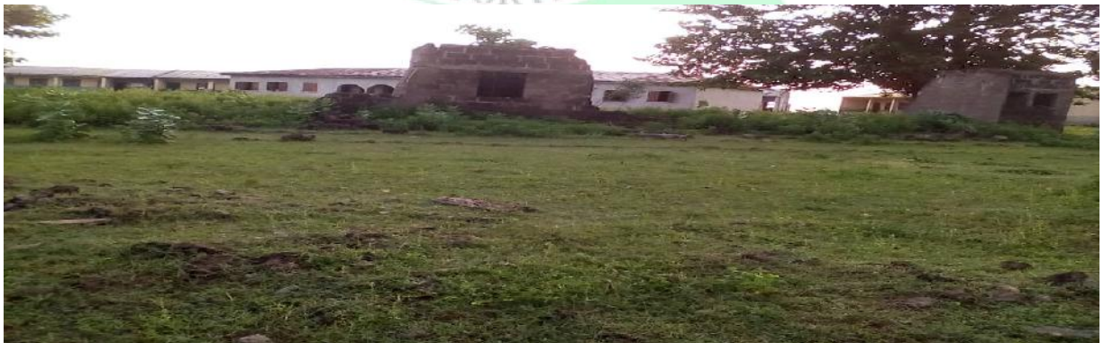
Abandoned 2 classroom block