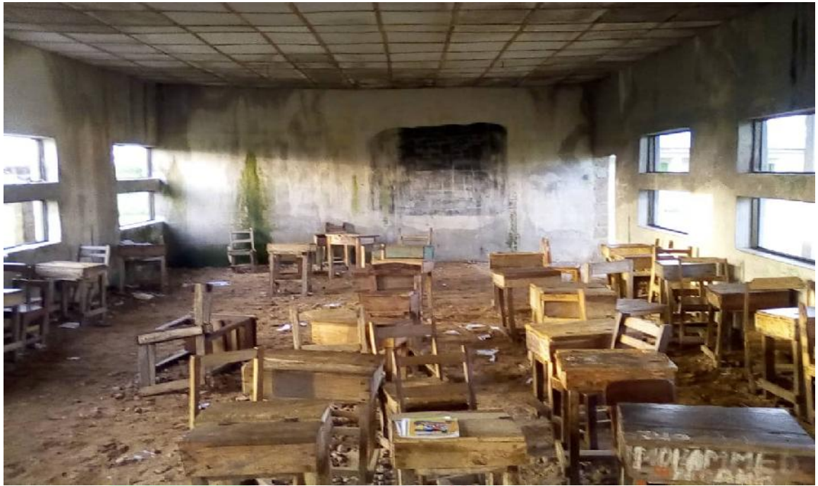
Uncompleted chemistry lab converted to classroom