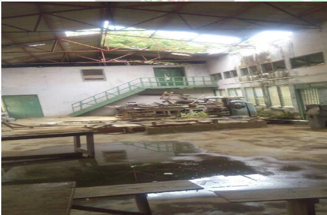
Motor Mechanical Engineering, Physics Laboratory and Electrical Engineering Department