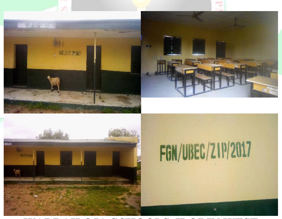
WARRAH OJA SCHOOLS, ILORIN WEST