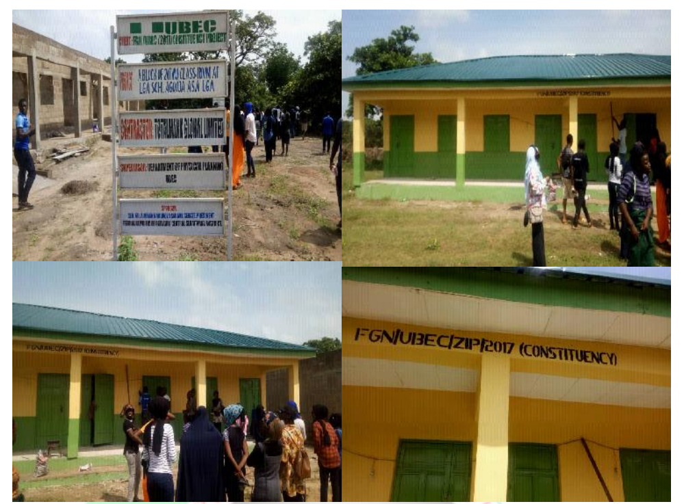
LGEA SCHOOL AGO OJA, ASA LGA (N9,975,000.00)