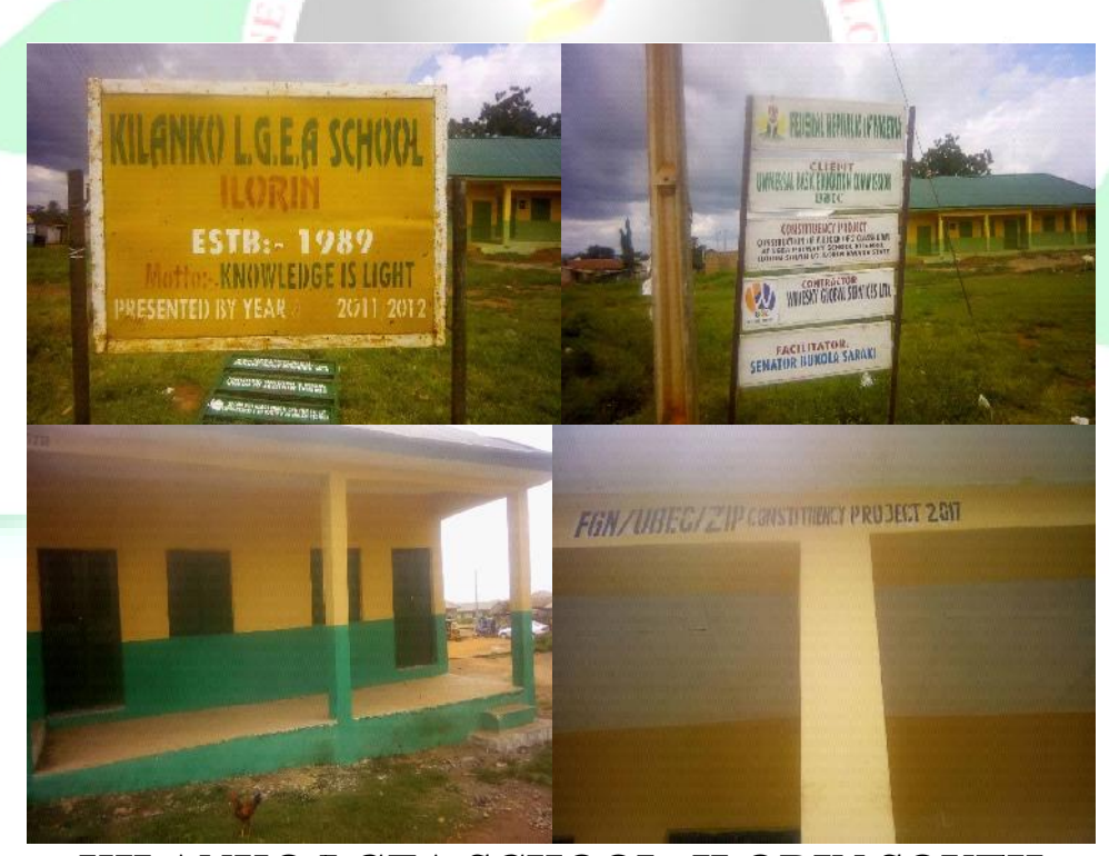
KILANKO LGEA SCHOOL, ILORIN SOUTH