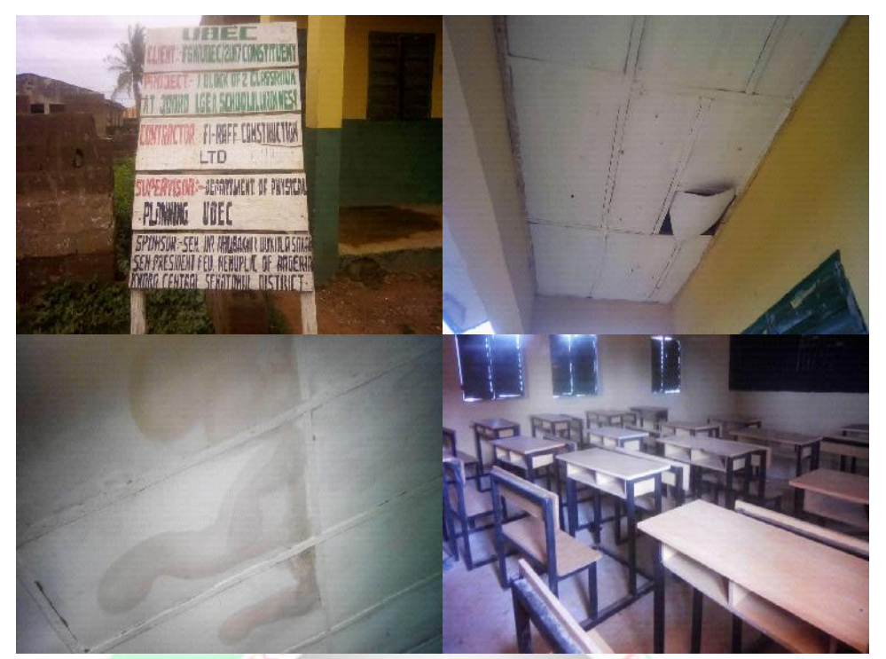
JOORO LGEA SCHOOL, ILORIN WEST