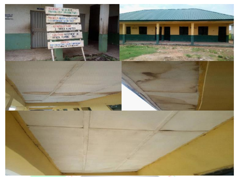
JSS ANIFOWOSE ILORIN WEST