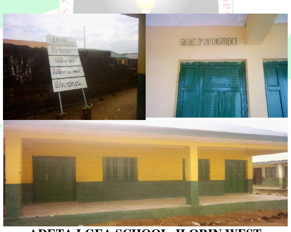
ADETA LGEA SCHOOL, ILORIN WEST