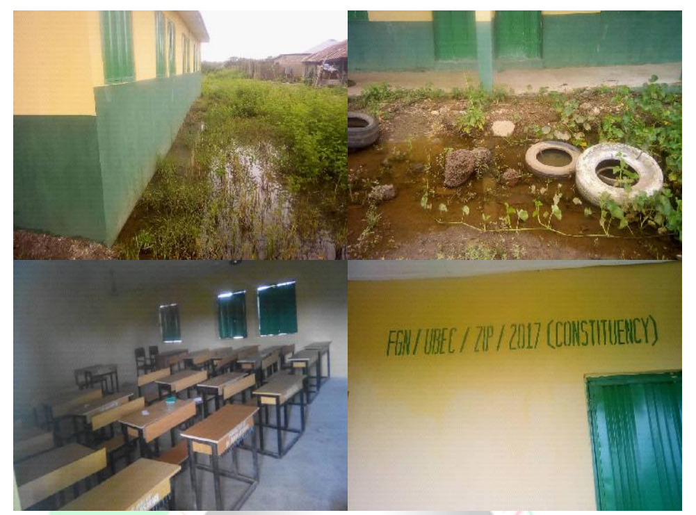
ALENIBORO LGEA SCHOOL, ILORIN WEST