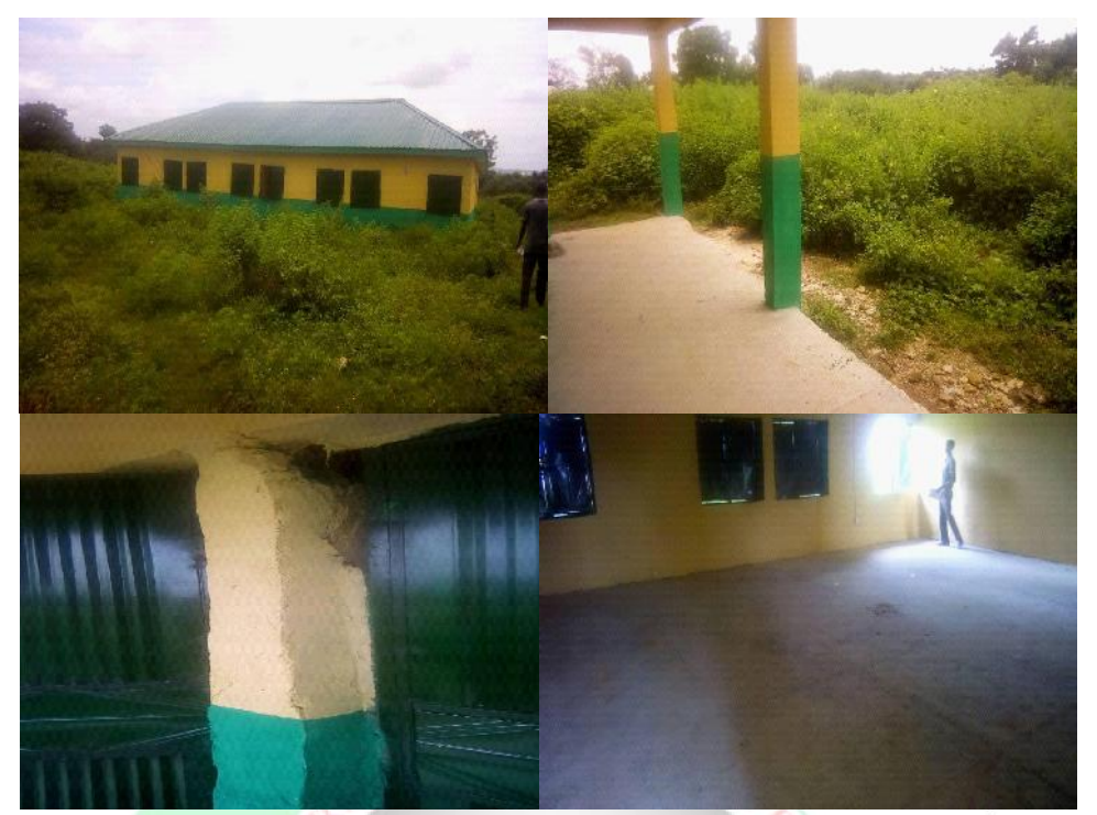
JUNIOR SECONDARY SCHOOL OSIN-AREMU