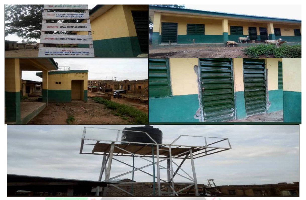
ABAYAWO LGEA SCHOOL, ILORIN WEST