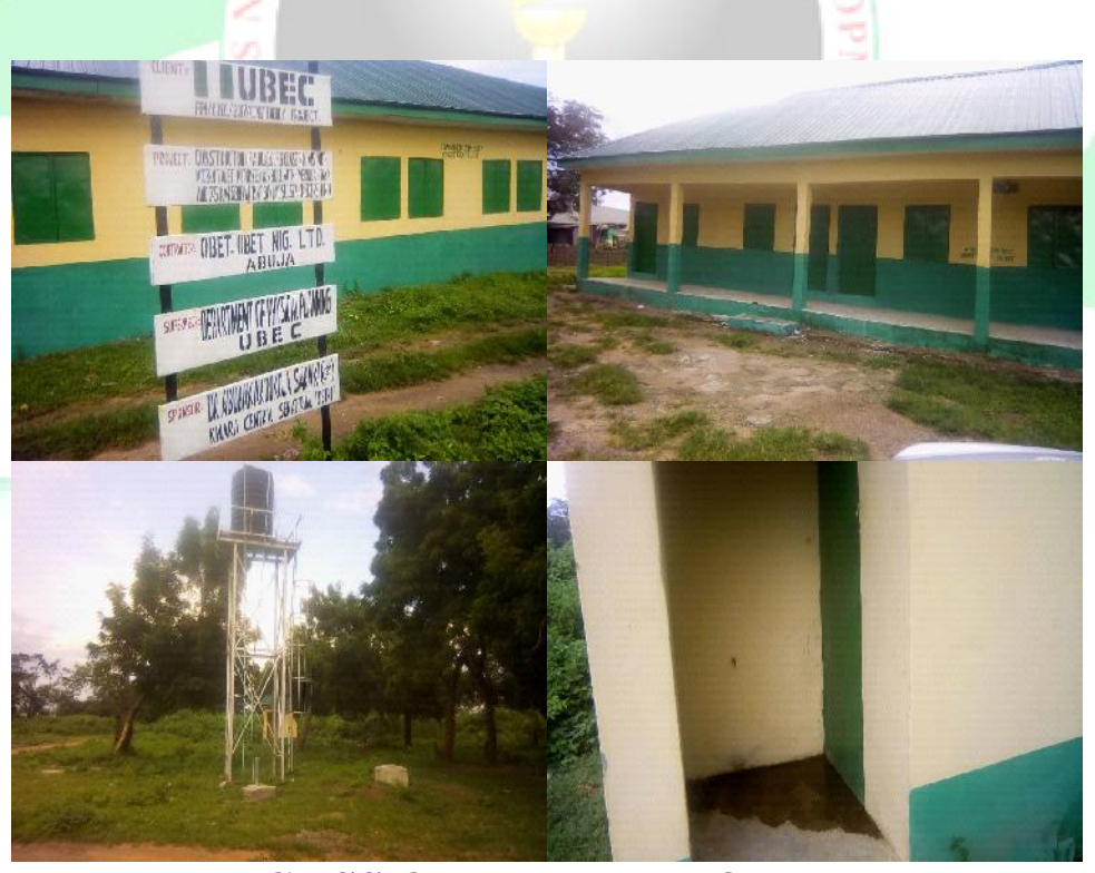
GDSS OKEKERE, ILORIN