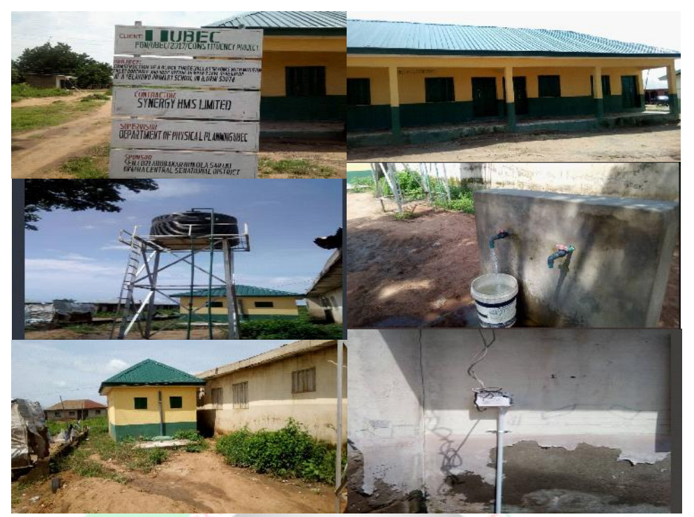
AYELABOWO PRIMARY SCHOOL ILORIN SOUTH