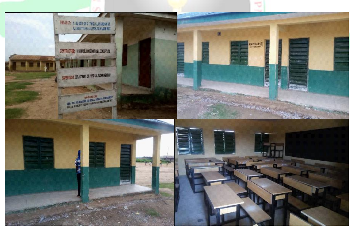
AL-ADDABIYYAH KAMALIYYAH JSSS ILORIN WEST