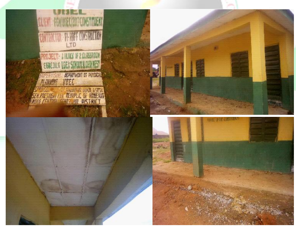
EGBEJILA LGEA SCHOOL ILORIN WEST