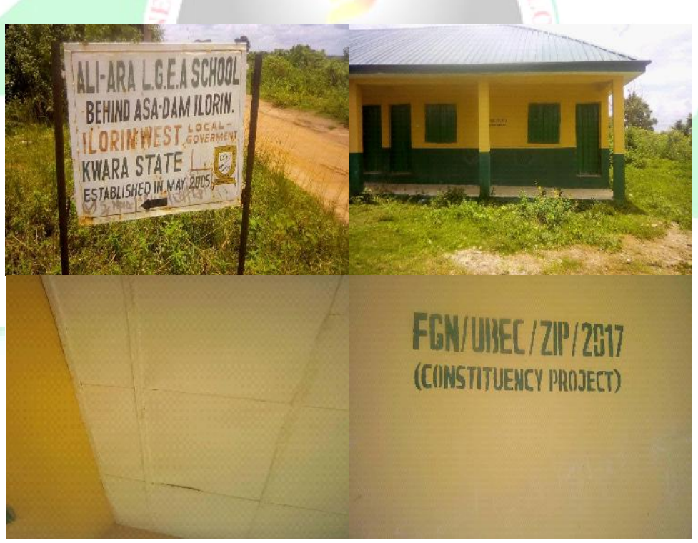
ALI-ARA LGEA SCHOOL ILORIN WEST