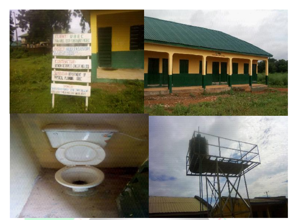
GDJSS ADETA, ILORIN WEST LGA