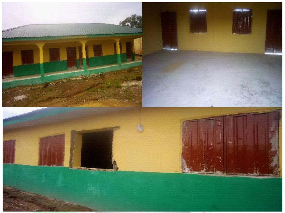
PROGRESSIVE JSS ADEWOLE ILORIN WEST