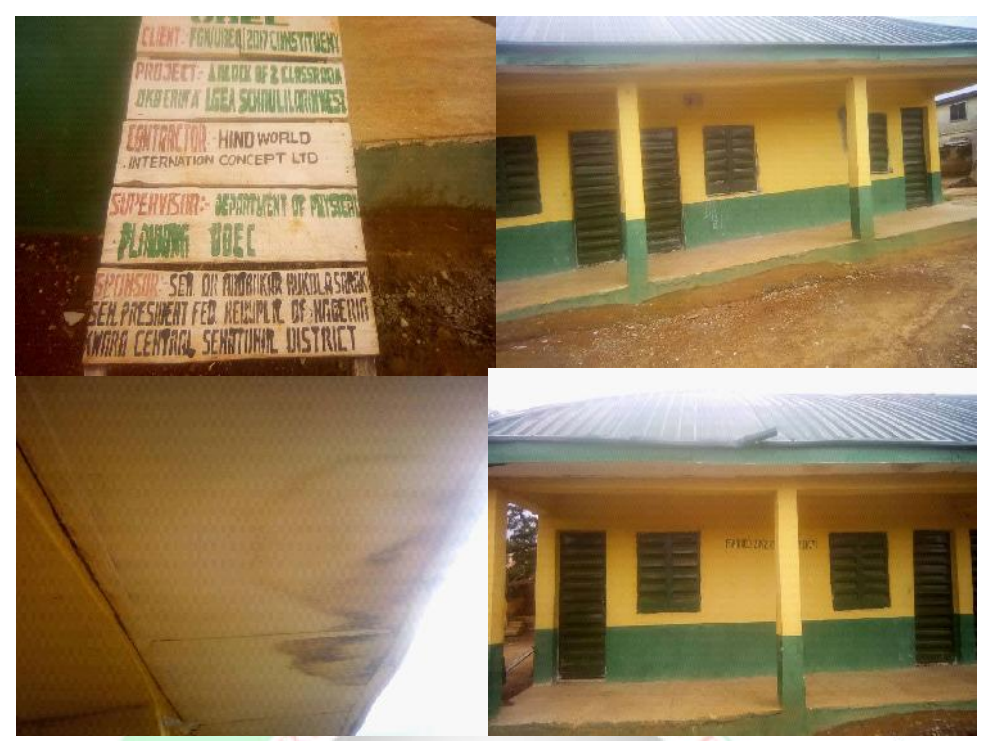
OKO-ERIN LGEA SCHOOL ILORIN WEST