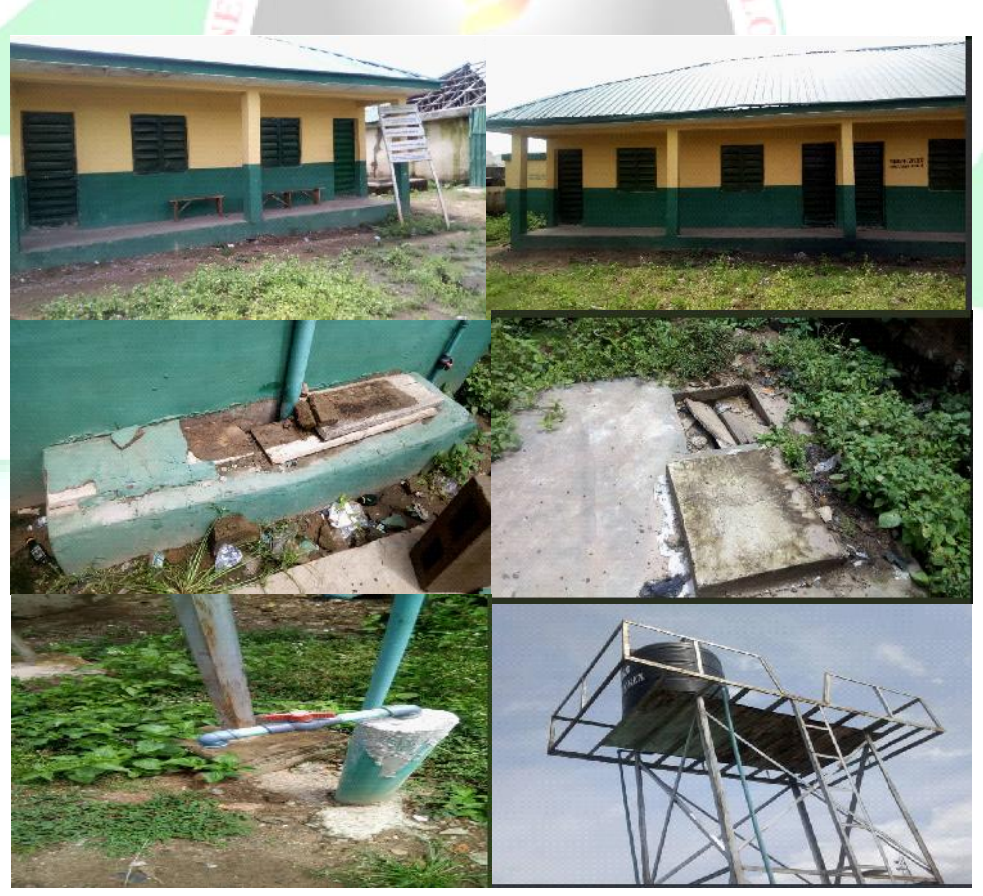
JSS OLOJE ILORIN WEST