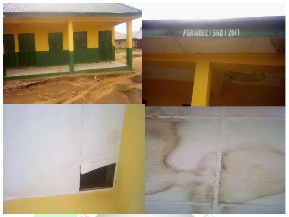
GBAGBA LGEA SCHOOL, ILORIN WEST