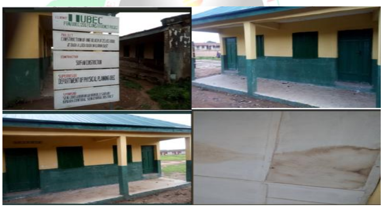
DADA LGEA DADA ILORIN EAST