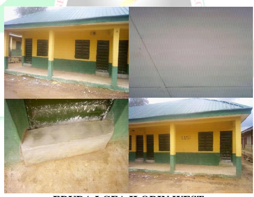
ERUDA LGEA ILORIN WEST