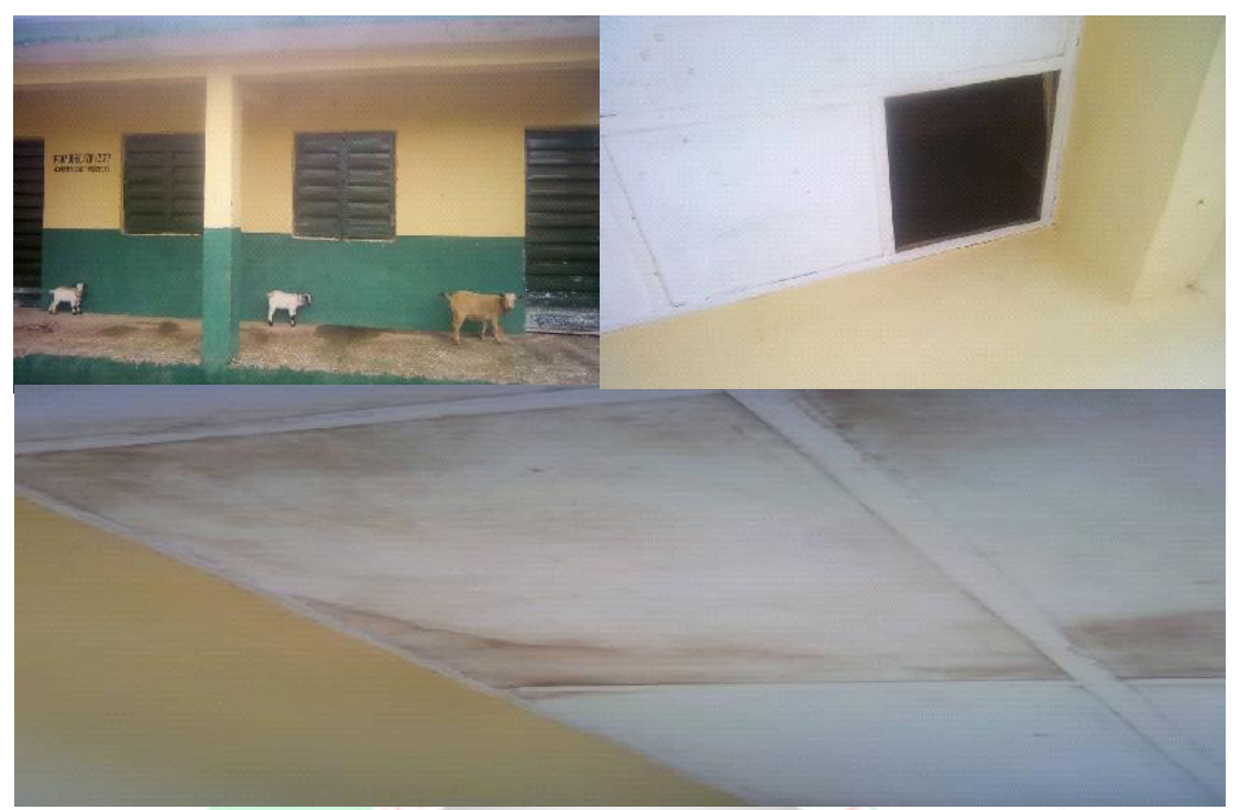
IKHWAU ZOOFAT LGEA SCHOOL OKEFOMA, ILORIN WEST