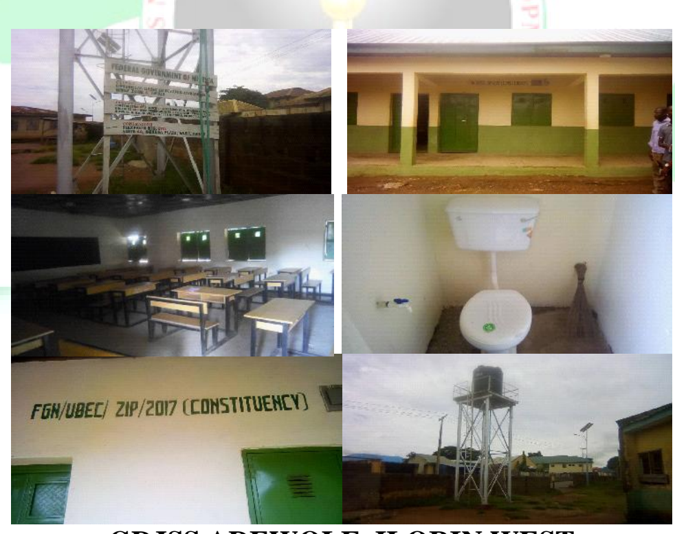
GDJSS ADEWOLE, ILORIN WEST