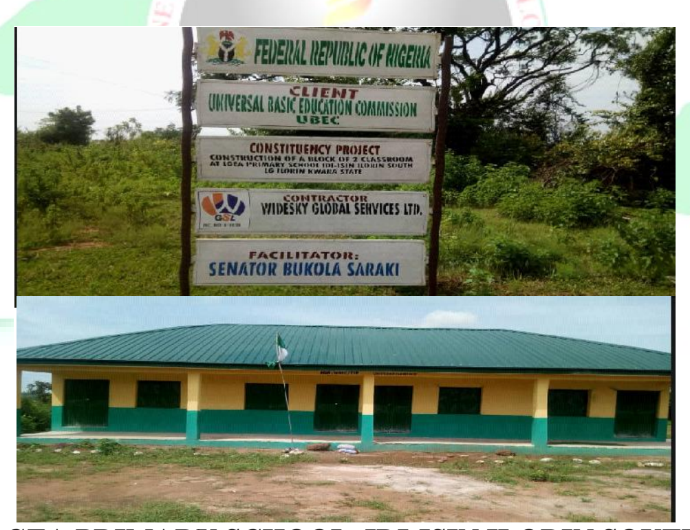
LGEA PRIMARY SCHOOL, IDI-ISIN ILORIN SOUTH