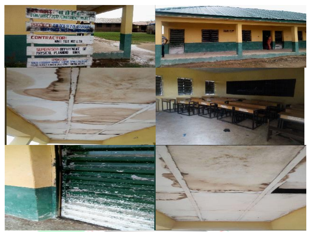
LGEA PRIMARY SCHOOL OGIDI WEST