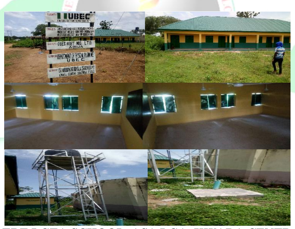
ELERE LGEA SCHOOL, ASA LGA, KWARA CENTRAL