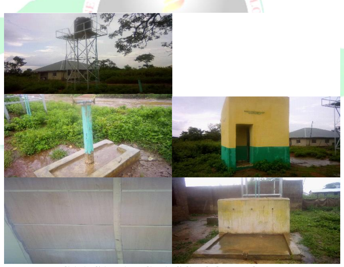
GAA SAKA LGEA SCHOOL ILORIN